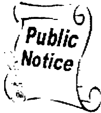
Table of Clean Water Act Civil Penalty Order Public Notices (Posted below are penalties that have been publically noticed i

EPA Home Region 7 Laws & Regulations Clean Water Act Public Notices Clean Water Act NPDES Storm Water Public Notices